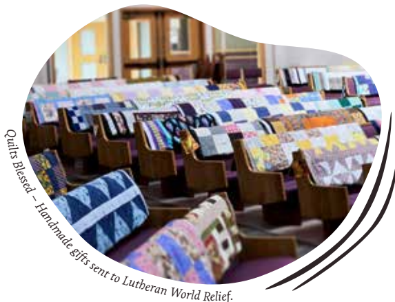
Quilts Blessed – Handmade gifts sent to Lutheran World Relief.