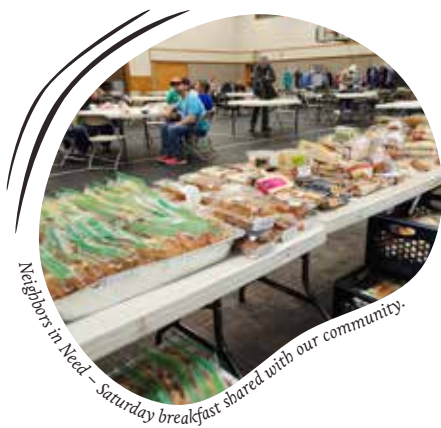
Neighbors in Need – Saturday breakfast shared with our community.

One way we extend compassion beyond our walls is through Trinity's Mission Giving Fund , which designates 2% of our annual contribution income to support local ministry partners. In 2025, our congregation chose Cocoon House, providing shelter and support for youth experiencing homelessness, as the recipient of these gifts.