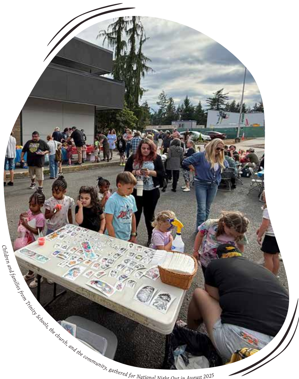
Children and families from Trinity Schools, the church, and the community, gathered for National Night Out in August 2025